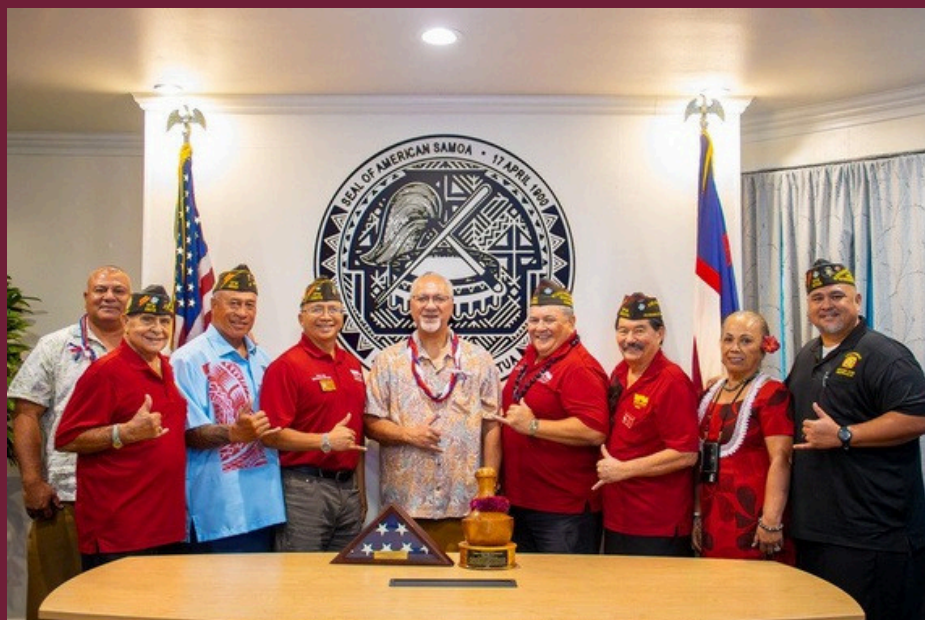
VFW Department of Hawaii met with Governor Pulaalii'i.

Led by State Commander Benedict Fuata, the Veterans of Foreign Wars (VFW) Department of Hawaii traveled more than 2,600 miles to stand in solidarity with VFW Post 3391. They proudly marched in the Flag Day parade, celebrated Samoan culture, and delivered essential services to local veterans—embodying the Department's motto: Polynesian Pride – Where Veterans Matter Most!